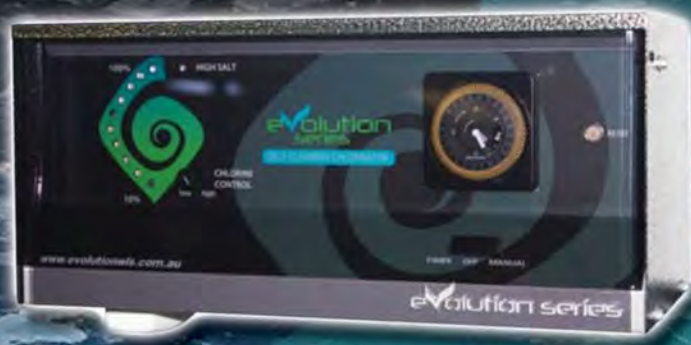
evolution Series Chlorinator